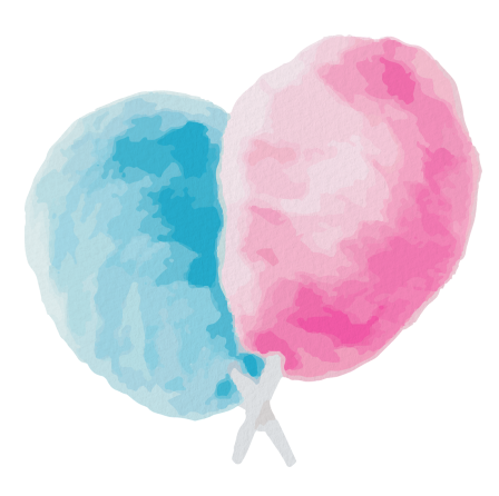
Cotton Candy $4.50